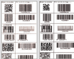
BPL-Z™ vs ZPLII