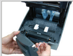
Auto-Cutter : Easy installation