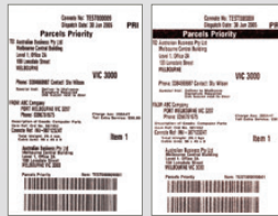
BPL-Z™ vs ZPLII