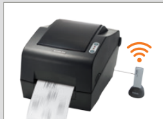
WLAN connectivity using USB dongle